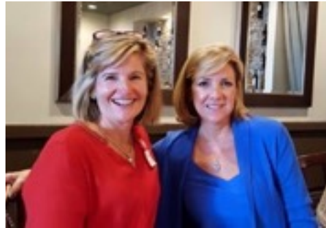
Past Presidents' Luncheon