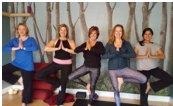
Global Flavors – Yoga Class