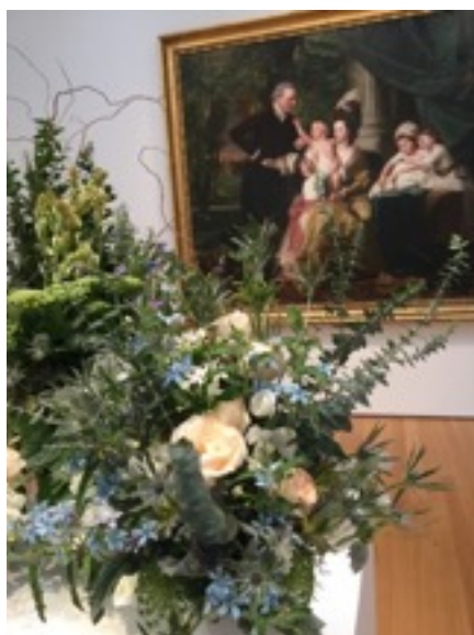
Global Flavors – Art in Bloom, NC Art Museum