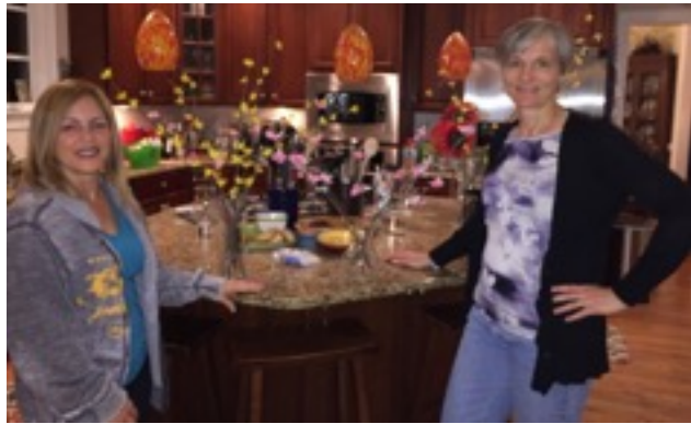
Creatively Crafty – Paper Flowers